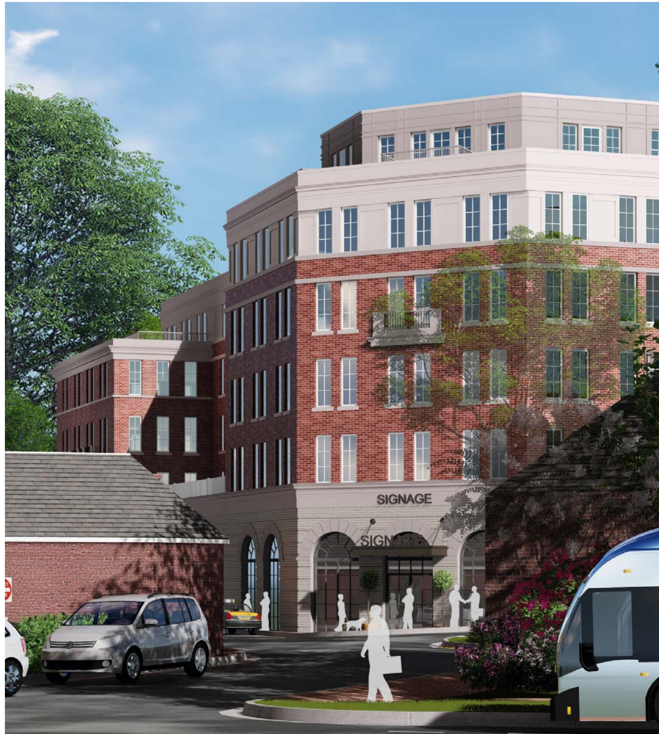
View from Southwest Proposed (Mass Ave)