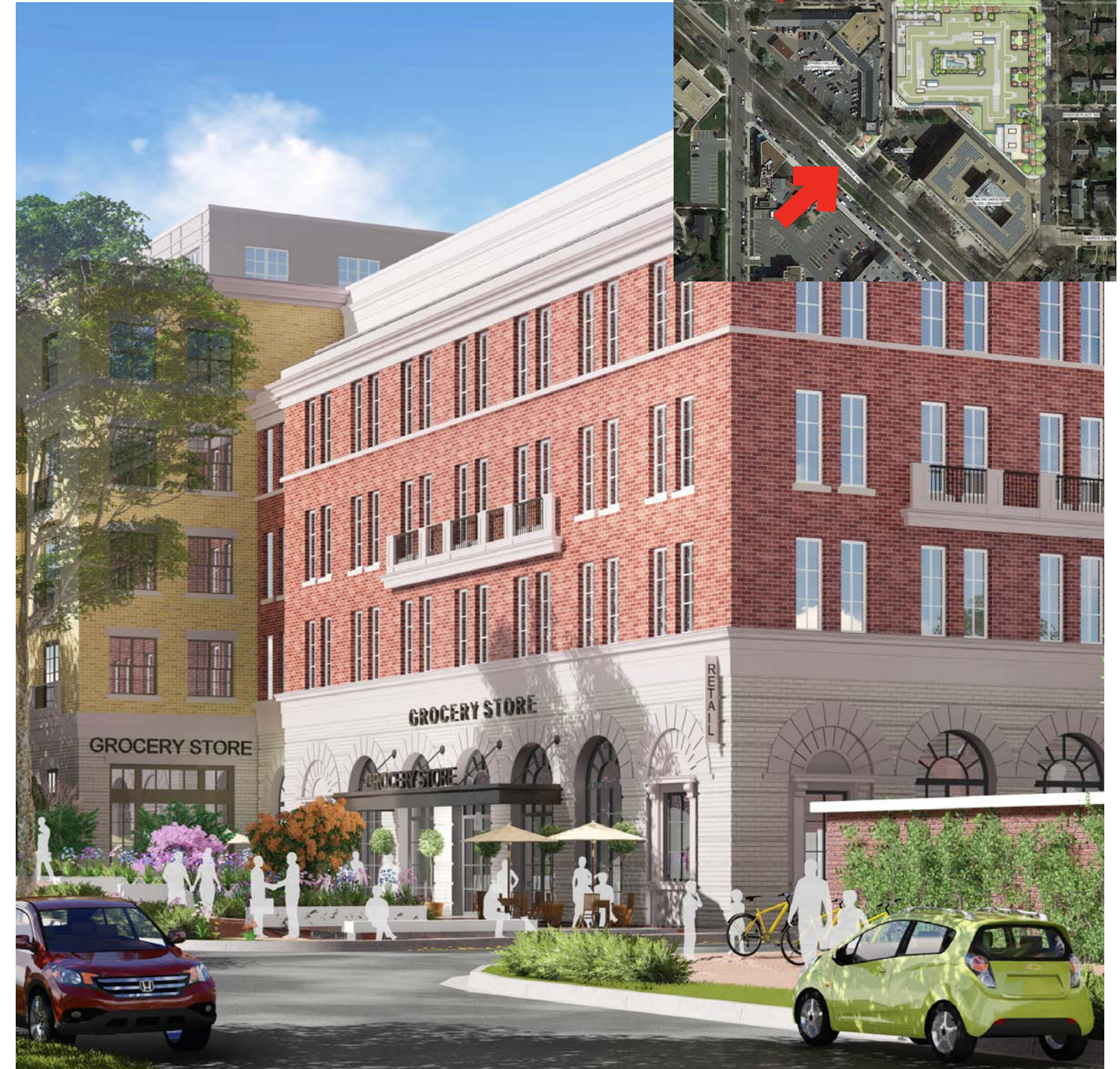
View from Northwest - Proposed (North Side of Yuma Street)